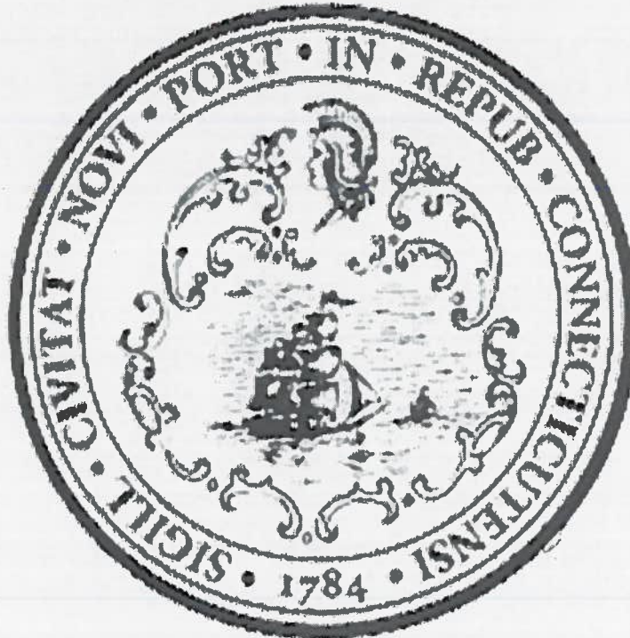
The Seal Of The City Of New Haven