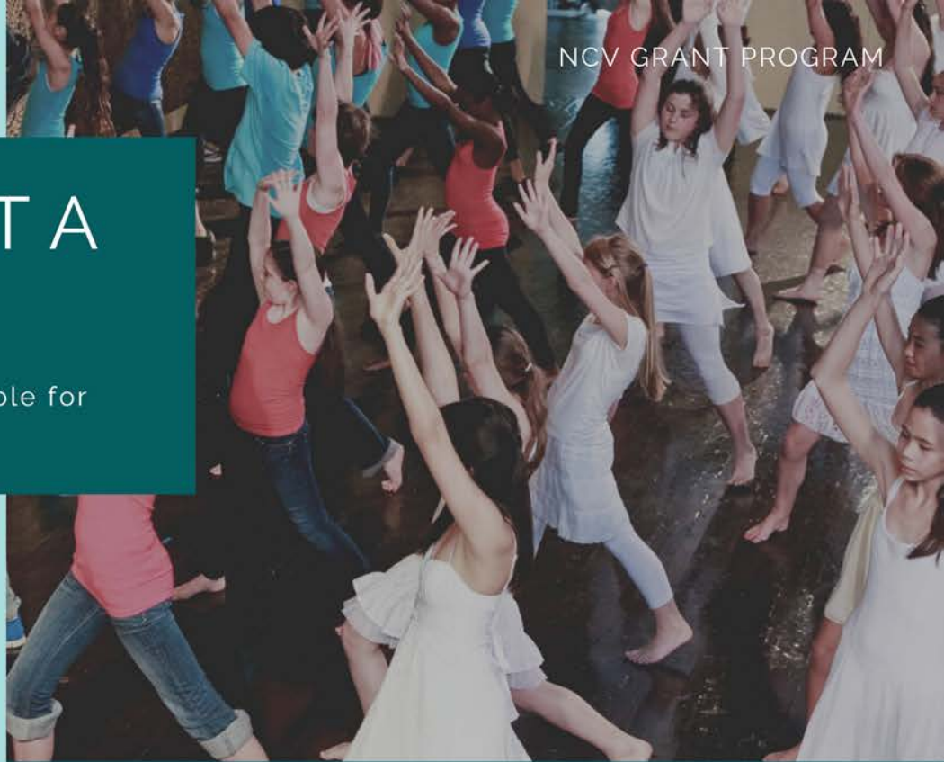
Neighborhood Music School Centennial Celebration, Woolsey Hall