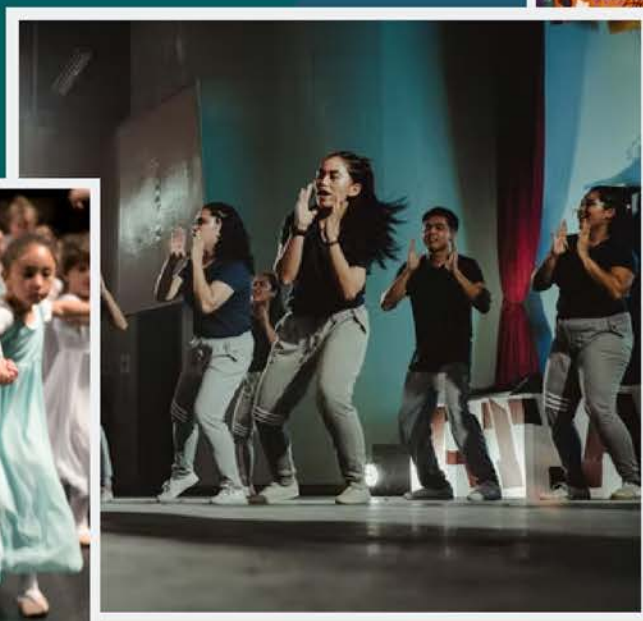
Neighborhood Music School