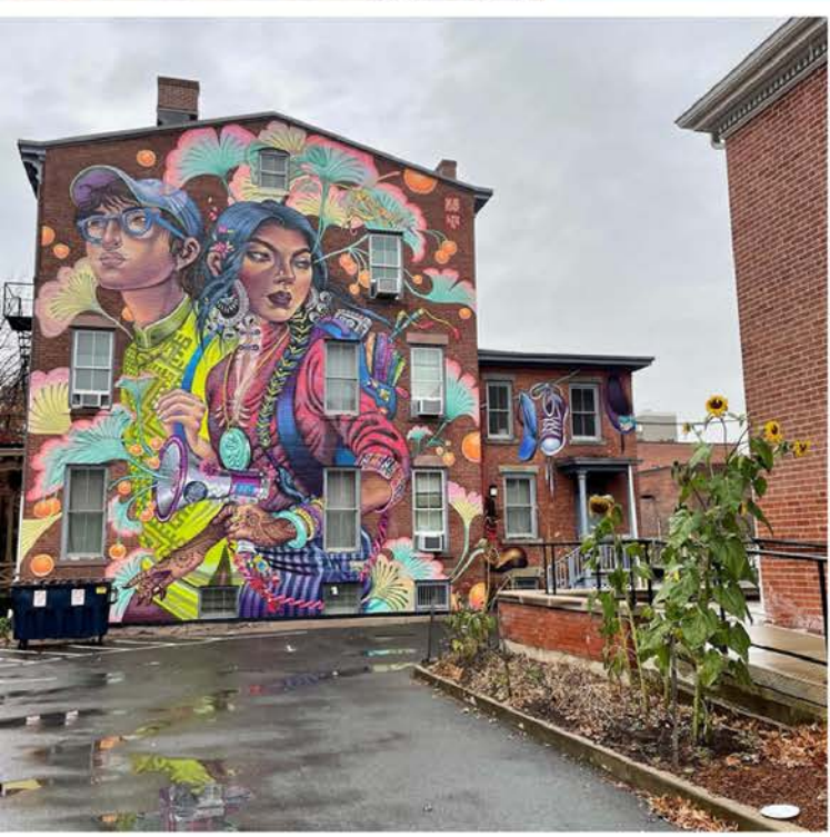
Neighborhood Music School Dance Department