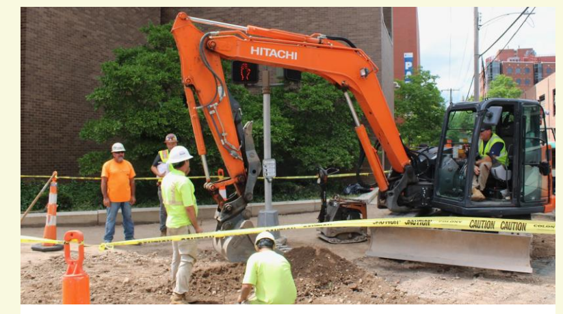
29 Audubon St. (Phase 3)