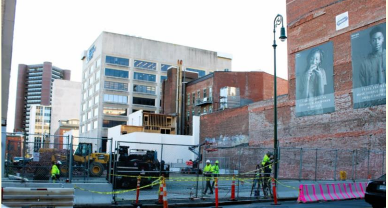
Mid-Block / Corner Block