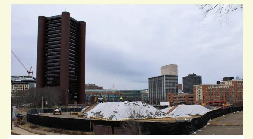
275 S. Orange St