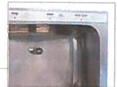
TOUCH FREE SENSOR OPERATED BASIN