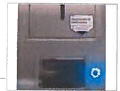
RECESSED AUTOMATIC PAPER DISPENSER