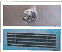
AUTO WASH AND FLOOR DRYING