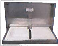
RECESSED BABY CHANGING TABLE