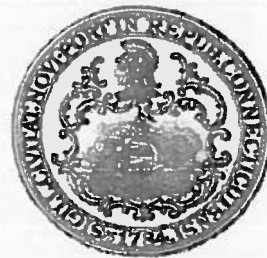
Justin Elicker Mayor